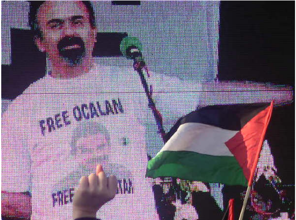
A Kurdish representative and news that Turkish forces have entered Kurdish Iraq. ( Listen. )